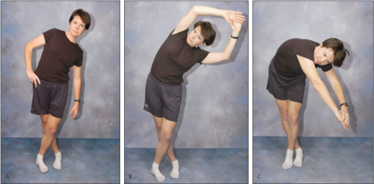
FIGURE 4. Stretches of the right iliotibial band.