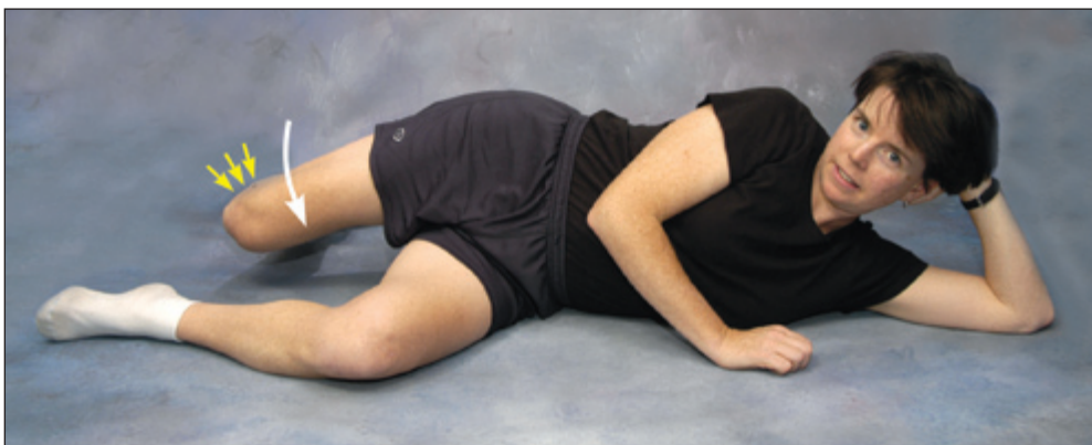
FIGURE 2. Ober's test. The patient lies down with the unaffected side down and the unaffected hip and knee at a 90-degree angle. If the iliotibial band is tight, the patient will have difficulty adducting the leg beyond the midline and may experience pain at the lateral knee ( arrows ).

If the iliotibial band is tight, the leg will remain in the abducted position and the patient may have lateral knee pain when Ober's test is conducted.