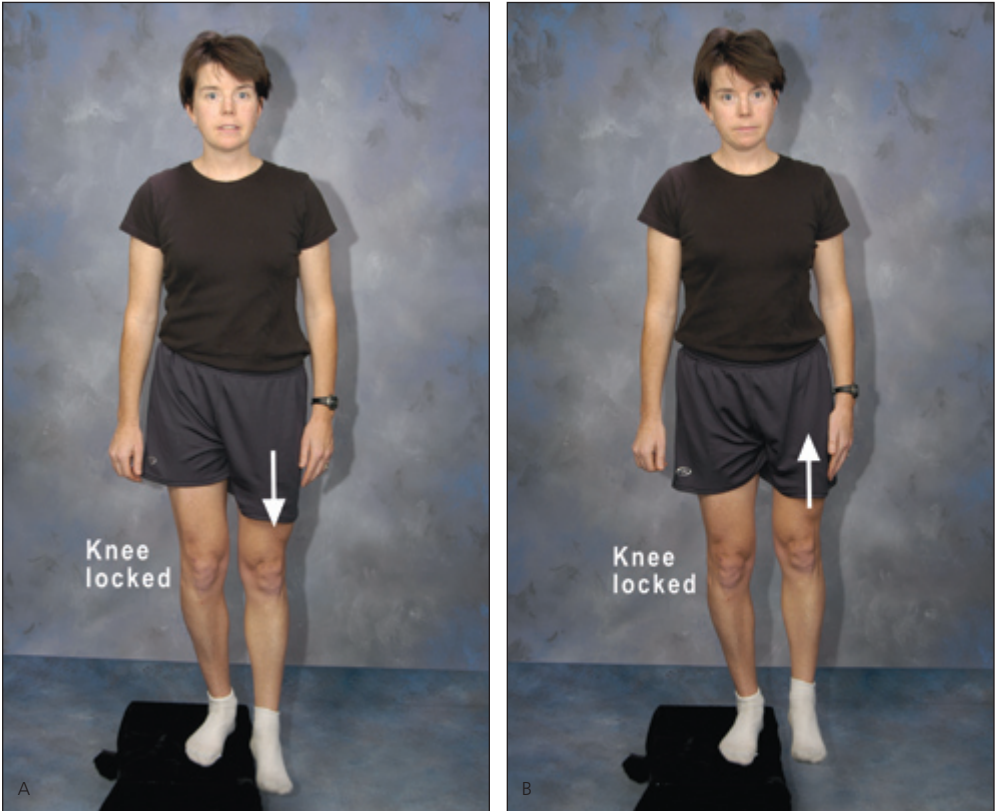
FIGURE 5. Exercise for strengthening of the right gluteus medius muscle in a weight-bearing position. (A) The patient stands on a platform and lowers the left leg toward the ground slowly. (B) Through contraction of the right gluteus medius, the patient then elevates the leg, returning the pelvis to a level position.