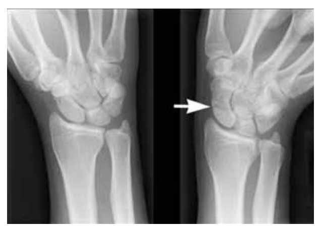
Figure 3. Routine ( left ) and scaphoid ( right ) views of nondisplaced wrist fracture ( arrow ).

If the diagnosis remains unclear after radiography, or if the clinical course does not improve with conservative measures, further imaging modalities are indicated. For suspected mechanical pathology such as an occult ganglion, an occult fracture, nonunion, or bone necrosis, the physician must choose from several modalities