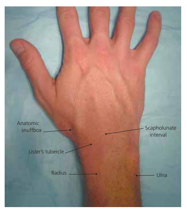
Figure 2. Anatomy of the wrist (dorsal view).