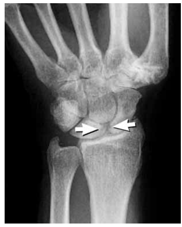
Figure 4. Scapholunate dissociation (arrows).

(e.g., ultrasonography, technetium bone scan, computed tomography [CT], or magnetic resonance imaging [MRI]). Ultrasonography is a quick and accessible way to assess soft-tissue abnormalities such as tendon injury, synovial thickening, ganglia, and synovial cysts. However, the effectiveness of this modality is highly operator dependent, and it does not effectively assess the complex bony architecture.<sup>2,6</sup> Bone scans can detect osteoblastic activity and have high sensitivity and low specificity.<sup>7</sup> Bone scans also can identify early stress injuries and can effectively rule out a scaphoid fracture. However, MRI may be equally sensitive and more specific than a bone scan.<sup>8,9</sup> CT can evaluate fractures and articular subluxations not identified by routine radiography;<sup>4</sup> however, MRI may be more effective in evaluating soft tissue injuries (e.g., muscle, ligament, cartilage, and bony lesions).<sup>10,11</sup> For example, subtle ligament injuries such as complete scapholunate ligament tears are more effectively identified with MRI than with CT.<sup>14</sup> If all imaging results are negative, but clinically significant wrist pain persists, the physician should consider referring the patient to a specialist for further evaluation, which may include cineroentgenography (dynamic real-time imaging under fluoroscopy), a diagnostic arthrography, or arthroscopy.