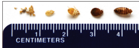
Figure 1. Bedbug life cycle from nymph (left) to larval exoskeletons (right).