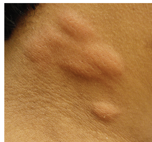
Figure 3. Bedbug bites resulting in wheals.

In addition to the physical manifestations of bedbug bites, patients can experience significant psychological distress. The stigma that