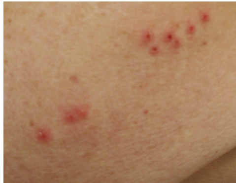
Figure 4. Bedbug bites grouped in a characteristic row or cluster.

Uncommon: bullae, nodules, secondary infection, systemic signs