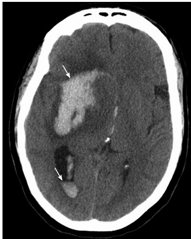
Figure 2. Head computed tomography showing intracerebral hemorrhages (arrows).

All patients with stroke symptoms should undergo urgent neuroimaging with noncontrast computed tomography (CT) or MRI. 9,37 The primary purpose of neuroimaging in a patient with suspected ischemic stroke is to rule out the presence of nonischemic central nervous system lesions and to distinguish between ischemic and hemorrhagic stroke. Figures 2 and 3 show examples