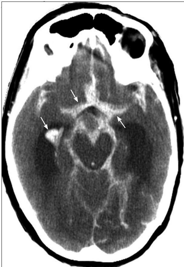
Figure 3. Head computed tomography showing subarachnoid hemorrhages ( arrows ). Note that acute hemorrhage appears hyperdense ( white ) on computed tomography.

Reprinted with permission from Yew KS, Cheng E. Acute stroke diagnosis. Am Fam Physician. 2009;80(1):38.