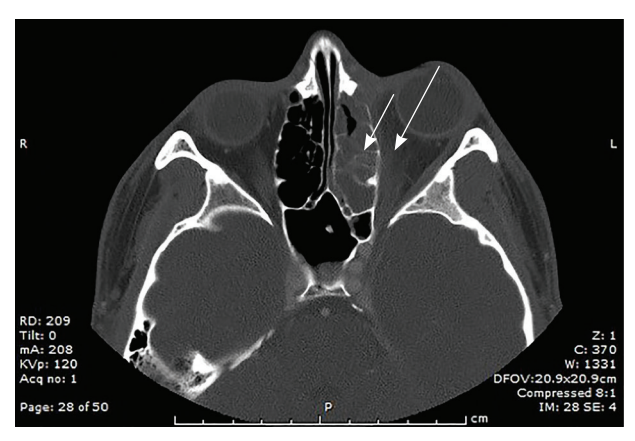
Figure 6. Computed tomography showing orbital cellulitis (long arrow) and adjacent sinusitis (short arrow).

Medications such as glucocorticoids are known to cause periorbital cutaneous inflammation.<sup>13</sup> Other drugs, including allopurinol, cephalosporins, corticosteroids, and valproic acid (Depakene), have reported