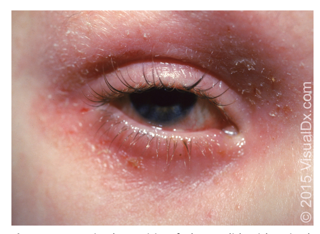
Figure 5. Atopic dermatitis of the eyelid with raised, scaled plaques.