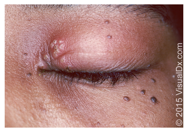
Figure 3. Herpes simplex vesicles at the medial aspect of the superior eyelid.

Computed tomography of the orbits with intravenous contrast media distinguishes preseptal from orbital