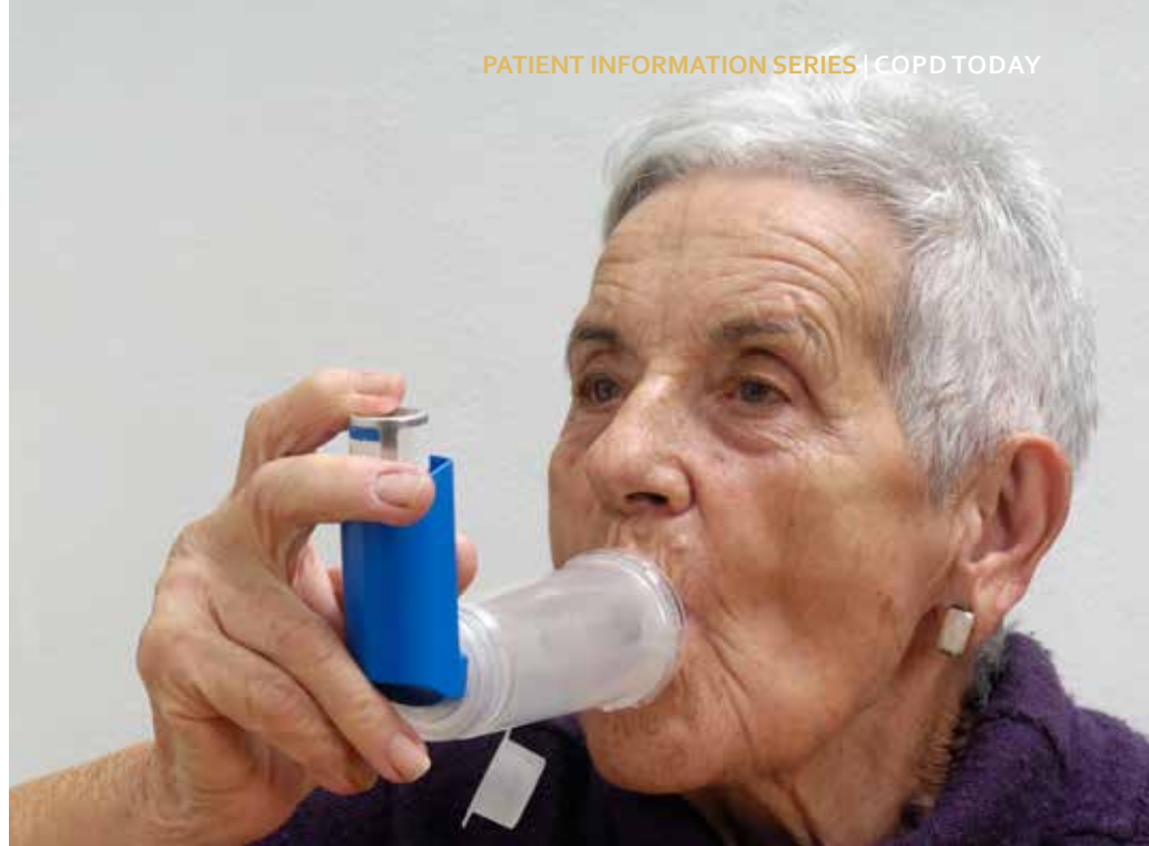
Adding a spacer may make it easier to use an inhaler for controlling COPD.

Another way to take an inhaled medication is with a nebulizer, a device that converts liquid medicine into a fine mist that is inhaled using a mouthpiece or mask. A nebulizer is particularly effective for the elderly or someone experiencing severe breathing problems. If you do use a nebulizer, make sure you know how to keep