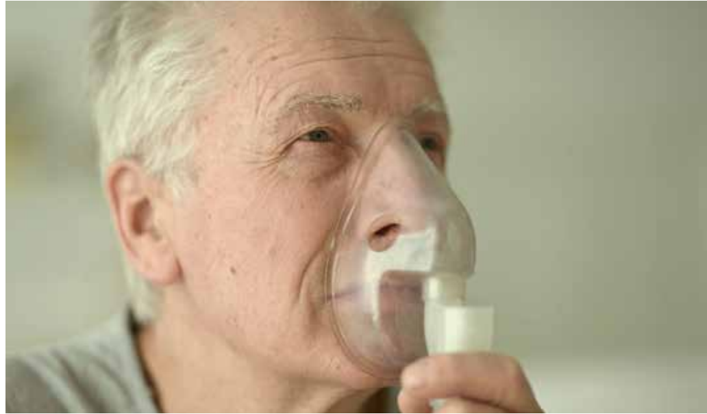
A nebulizer is particularly effective for the elderly or someone experiencing severe breathing problems.

Because being diagnosed with COPD is stressful, you also may be referred to mental health specialists who treat depression and anxiety and also can provide counseling for family members. These mental health specialists can include psychiatrists, psychologists, and social workers.