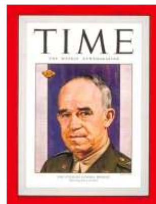
General Omar Bradley VA Administrator 1945-1947