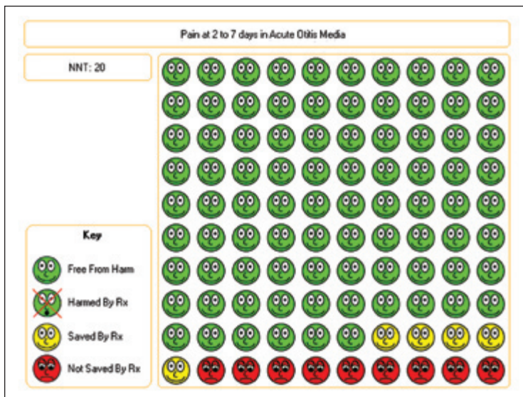
Figure 2. Visual display of the number needed to treat (NNT) generated at http://www.nntonline.net . NNT = 20 (100/5). (Rx = treatment).

Reprinted with permission from Dr. Chris Cates' EBM Web site. Visual Rx—examples. http://nntonline.net/visualrx/examples . Accessed November 3, 2008.