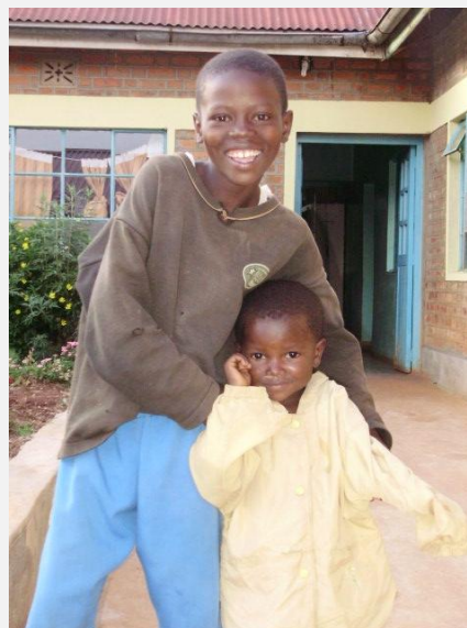
Two of the "peds" patients outside the children's ward.

Finally, and most importantly, I was struck by the indispensability of family. With the nearest ventilator 2.5 hours away over dangerous mud roads, that man would have died without his family stepping up to bag him. I think the same thing is true in America, it's just not quite so blatantly obvious, so we choose to ignore it. The simple fact of the matter is that we need families, patients need their support, and we as physicians need families to be intimately involved in their patient's care. With ventilators but without families we may survive but none of us will thrive.