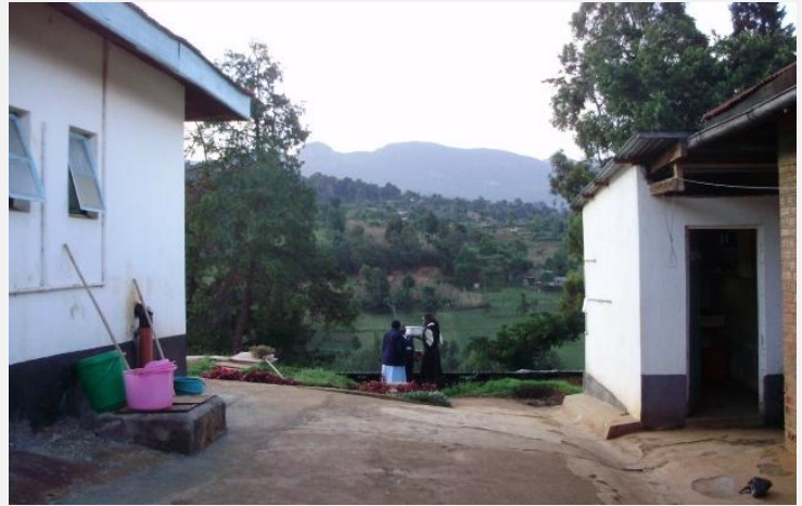
The view from the main "hallway" of the hospital between women's wards

The first lesson this patient taught me was to do what you know while calling for help. I had never seen organophosphate poisoning before, but it was the only farming poison I could come up with and it fit the pattern. I also knew that people die without air. So I bagged and gave atropine. Since that was all I knew, I then called my attending who was able to confirm the diagnosis and lead the rest of the resuscitation. So even, if like me, all you can remember is the ABC's, simply doing what you know will save lives and calling for help will deal with the rest.