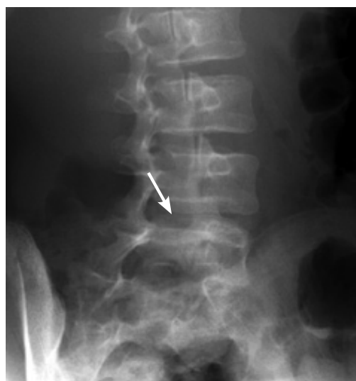
Figure 2. Oblique radiograph showing spondylolysis ( arrow ).