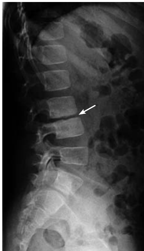
Figure 1. Lateral radiograph showing sclerosis and disk-space narrowing ( arrow ), which are consistent with diskitis.

Fever and other generalized symptoms occurring with back pain suggest possible infection or tumor. Diskitis commonly is associated with fever, anorexia, malaise, and irritability in children younger than 10 years. In children one to three years of age, diskitis may be associated with cessation of walking. 25 In older children, abdominal pain also may be present. A positive straight leg raising test result, caused by tight hamstrings, is common. Radiographic findings may be normal early (less than three weeks after the pain begins) but later show disk-space narrowing and end-plate changes ( Figure 1 ). Complete blood count and erythrocyte sedimentation rate are usually elevated, and Staphylococcus aureus is the most common organism associated with diskitis. 26 If radiographic findings are normal and the erythrocyte sedimentation rate is elevated, a bone scan should be performed. Treatment with antibiotics and immobilization usually resolves symptoms in about three weeks.