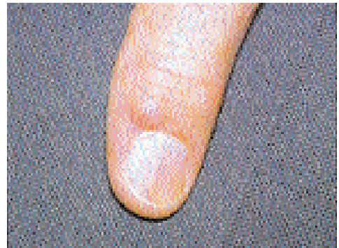
FIGURE 1. Digital mucous cyst.

Digital mucous cysts are frequently asymptomatic. 1,6 Patients may experience decreased range of motion in the nearby joint along with pain, tenderness, and nail deformity. 1-3,8 Nail ridging, which is caused by pressure on the nail matrix, may be present in one third of cases. 5 Damage to the nail matrix during treatment can cause permanent nail deformity. The cysts are usually chronic, and it has been suggested that the cysts rarely resolve spontaneously. However, results from one longitudinal study suggest that some cysts gradually regress. 3 A preceding history of trauma may be present, especially in patients younger than 40 years. 12 Transillumination may aid in correctly identifying cysts. 3,11