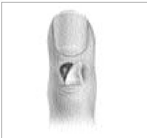
FIGURE 3B. The flap is rotated over the defect.

the possible cyst stalk to the joint, the treated area should include the cyst base and as far proximal as the transverse groove overlying the distal interphalangeal joint. 10 A freeze-thaw-freeze technique appears superior to a single freeze. 2,10