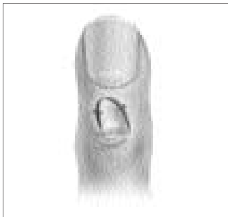
FIGURE 3C. One or two sutures may be used to stabilize the flap in a central position over the defect, or the flap may be left to heal by secondary intention.

Simple excision of cysts is associated with high recurrence rates. 3 A simple surgical technique, described below, has been shown to result in good cosmetic and functional outcomes for patients. 18 Following digital block, the skin over the cyst is incised and the lesion is carefully dissected from the surrounding connective tissue and the extensor tendon below it ( Figure 3a ). 18 A small, U-shaped rotation flap is created next to the circular defect created by the removal of the cyst. 6,18 The flap is moved to cover the defect and, preferably, is not sutured, but left to heal by secondary intention ( Figure 3b ). It is possible that the extra scarring created by not suturing the wound may result in more widespread scar formation and, consequently, a decreased chance of recurrence of the cyst. If the small rotation flap does not stay centered over the surgical defect, a single suture may be used to hold the flap in place ( Figure 3c ). The flap