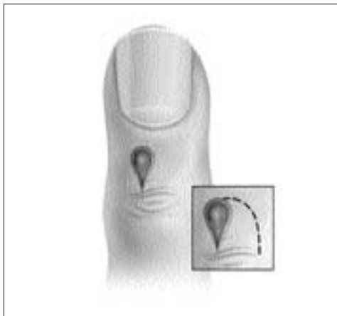
FIGURE 3A. Once the entire lesion is removed, a small rotation flap is created.