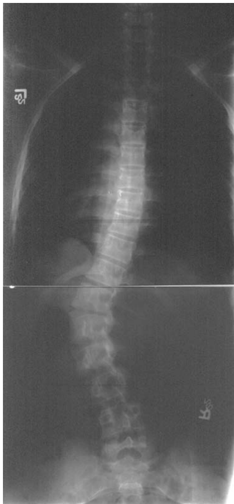
FIGURE 4. Posteroanterior radiograph of the spine in a patient with a thoracolumbar spinal curve. Left thoracolumbar curve, T10-L3 (most tilted vertebrae above apex of curve T10, most tilted vertebrae below apex of curve L3). The degree of curvature is 56.

develops to balance out a primary curve. A nonstructural curve differs from a structural curve because it can correct on lateral bending, distraction, or sitting.