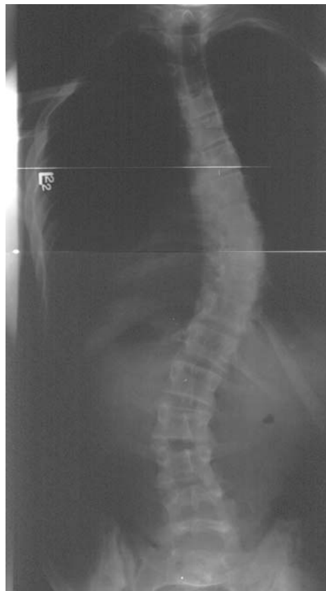
FIGURE 5. Posteroanterior radiograph of the spine in a patient with a double spinal curve. Double curve: right thoracic curve, T5-12 with a degree of curvature of 45; left lumbar curve, T12-L4 with a degree of curvature of 35.

The primary goal of treating adolescent idiopathic scoliosis is preventing progression of the curve magnitude. Curves less than 10 to 15 degrees require no active treatment and can be monitored, unless the patient's bones are very immature and progression is likely. Moderate curves between 25 and 45 degrees in patients lacking skeletal maturity used to be treated with bracing, but this treatment has