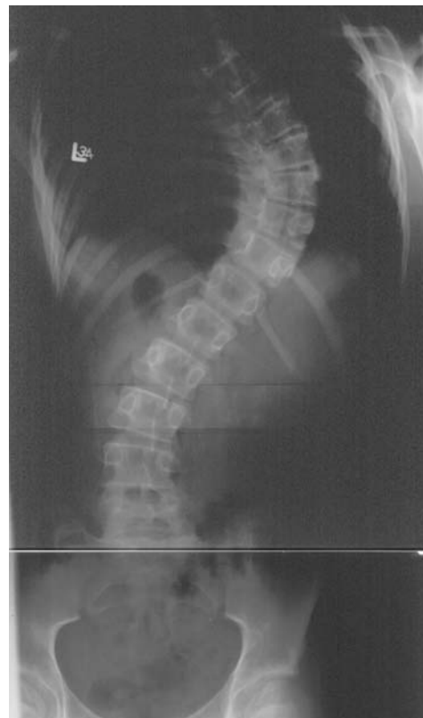
FIGURE 3. Posteroanterior radiograph of the spine in a patient with a thoracic spinal curve. Right thoracic curve, T6-11 (most tilted vertebrae above apex of curve T6, most tilted vertebrae below apex of curve T11). The degree of curvature is 65.

The standard radiologic evaluation of adolescent idiopathic scoliosis consists of standing posteroanterior radiographs of the full spine. Follow-up is necessary in those patients with severe curves who are at risk for significant curve progression or require some form of treatment. Any discrepancy in leg length should be corrected with a block placed under the patient's shorter leg when radiographs are taken. One study 23 has shown that long-term management of scoliosis poses no radiograph-related risks to patients, but posteroanterior views assure maximal safety by minimizing radiation to the breasts. The Cobb method is used to measure the degree of scoliosis on the posteroanterior radiograph (Figure 2). In addition to curve degree, physicians should describe curves as "right" or "left," based on their curve convexity. Standard measurement error is 3 to 5 degrees for the same