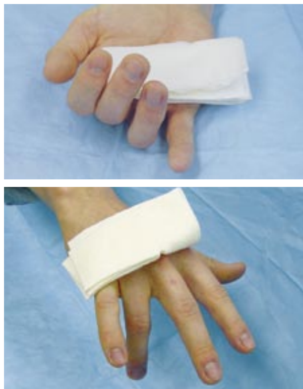
FIGURE 2. Typical hand and finger positions in patients with tendon injuries. (Top) Flexor tendon rupture. (Bottom) Extensor tendon rupture.

Although it is uncommon, swelling in the thenar or midpalmar spaces of the hand suggests an infectious etiology. Usual signs include redness, tenderness, and eventual fluctuation. The dorsum may swell more than the palm. 9(pp201-13) These infections and purulent tenosynovitis are treated just like fight bites, with urgent consultation for