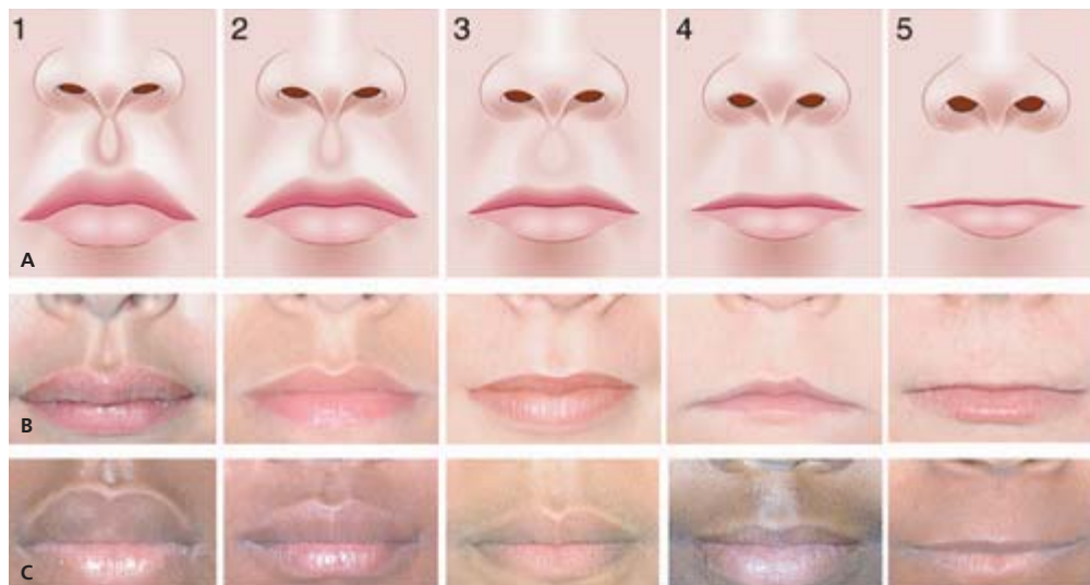
Figure 3. Lip-Philtrum Guide. (A) The smoothness of the philtrum and the thinness of the upper lip are assessed individually on a scale of 1 to 5 (1 = unaffected, 5 = most severe). The patient must have a relaxed facial expression, because a smile can alter lip thinness and philtrum smoothness. Scores of 4 and 5, in addition to short palpebral fissures, correspond to fetal alcohol syndrome. (B) Guide for white patients. (C) Guide for black patients.