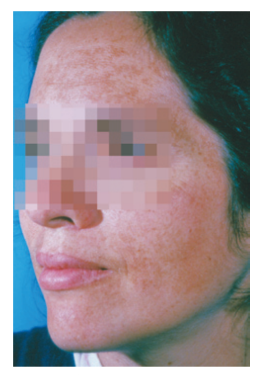
Figure 2. Melasma.

hirsutism on the face, limbs, and back caused by endocrine changes during pregnancy. Hirsutism generally resolves postpartum, although cosmetic removal may be considered if the condition persists. Pregnant women also may notice mild thickening of scalp hair. This is caused by a prolonged active (anagen) phase of hair growth. Postpartum, scalp hair enters a prolonged resting (telogen) phase of hair growth, causing increased shedding (telogen effluvium), which may last for several months or more than one year after pregnancy.<sup>12</sup> A few women with a tendency toward androgenetic alopecia may notice frontoparietal hair loss, which may not resolve after pregnancy.