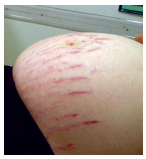
Figure 1. Striae gravidarum (stretch marks).

A = consistent, good-quality patient-oriented evidence; B = inconsistent or limited-quality patient-oriented evidence; C = consensus, disease-oriented evidence, usual practice, expert opinion, or case series. For information about the SORT evidence rating system, see page 149 or http://www.aafp.org/afpsort.xml.