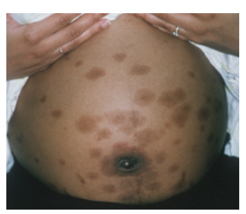
Figure 5. Pemphigoid gestationis.

Pemphigoid gestationis ( Figure 5 ), sometimes referred to as herpes gestationis, is an autoimmune skin disorder that occurs in one out of 50,000 mid- to late-term pregnancies.<sup>20</sup> Pemphigoid gestationis has been linked to the presence of HLA-DR3