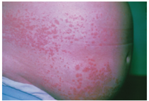
Figure 3. Pruritic urticarial papules and plaques of pregnancy. The rash presentation can vary; two examples are shown above.