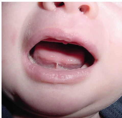
Figure 2. Infant with a short frenulum that, while breastfeeding, caused nipple damage in the mother, resulting in repeated episodes of mastitis. Treatment for the mother consisted of oral antibiotics and topical mupirocin (Bactroban). Once the infant had a frenotomy, she discontinued damaging her mother's nipples, gained weight appropriately, and continued breastfeeding for many months.

Infant mouth abnormalities (e.g., cleft lip or palate) may lead to nipple trauma and increase the risk of mastitis. Infants with a short frenulum ( Figure 2 ) may be unable to remove milk effectively from the breast, leading to nipple trauma. Frenotomy can reduce nipple trauma and is usually a simple, bloodless procedure that can be performed without anesthesia. 15 The incision is made through the translucent band of tissue beneath the tongue, avoiding any blood vessels or tissue that can contain nerves or muscle. 11