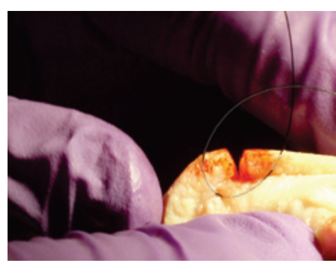
Figure 2. Proper technique of a single interrupted stitch for wound eversion and closure. The needle should pierce the skin at a 90-degree angle with the trailing suture following the curve of the needle, which is accomplished by twisting the wrist.

of the wound edges ( Figure 2 ), compensating for the eventual retraction of the scar during healing.<sup>13</sup> Traditionally, the suture begins in the middle of the wound, with the remaining stitches placed symmetrically until the wound is closed.