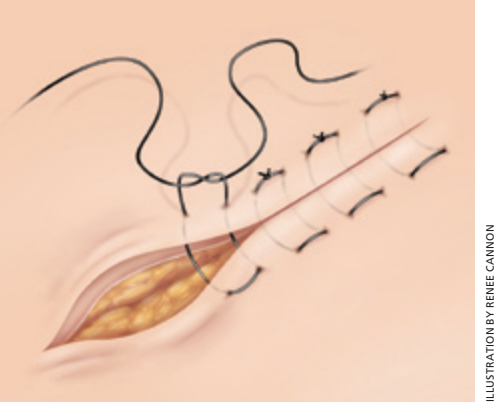
Figure 3. Horizontal mattress suture technique.

The horizontal mattress technique ( Figure 3 ) may be the best option for closing gaping or high-tension wounds or wounds on fragile skin because it spreads the tension along the wound edge. The vertical mattress technique ( Figure 4 ) is best for everting wound edges in areas that tend to invert, such as the posterior neck or concave skin surfaces.<sup>14</sup> A variation, called the half-buried mattress (corner) suture ( Figure 5 ), is ideal for closure of a triangular edge because it does not compromise the blood supply,