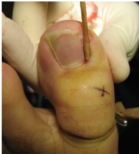
Figure 8. Application of phenol to the nail matrix.

Partial matricectomy via electrocautery, radiofrequency, and carbon dioxide laser ablation are all effective options in the treatment of ingrown toenails. Advantages of these techniques include less bleeding, reduced postoperative pain, and immediate sterilization of infected tissue. The carbon dioxide laser offers the advantage of limited thermal damage to adjacent tissues. Disadvantages include a commonly prolonged period for reepithelization and healing of the tissues by secondary intention and, consequently, local wound care for up to six weeks. 22 Staining of the nail matrix with methylene blue before performing a partial matricectomy with the carbon dioxide laser allows for better visualization of the nail matrix and can ensure complete cauterization. 20 Matricectomy via