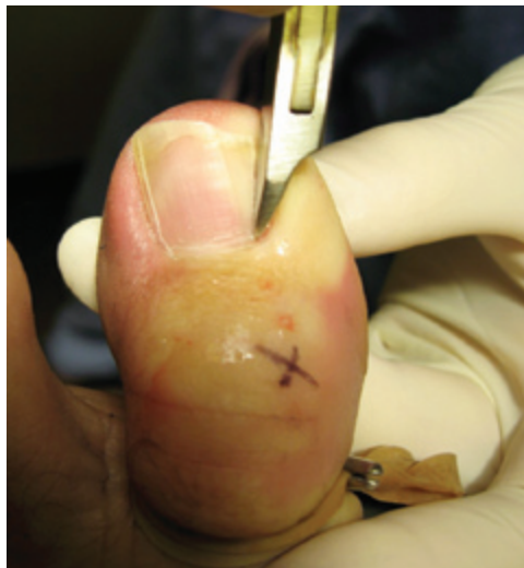
Figure 7. Cutting the ingrown portion of the nail with a nail splitter.