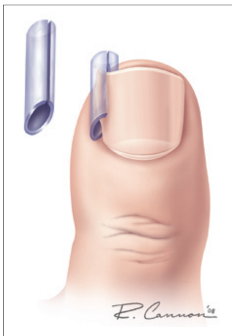
ILLUSTRATION BY RENEE CANNON

Another conservative treatment approach is to use a gutter splint (e.g., a sterilized vinyl intravenous drip infusion tube slit from top to bottom with one end cut diagonally for smooth insertion) that can be affixed to the ingrown nail edge with either adhesive tape or a formable acrylic resin such as cyanoacrylate 15 (Figure 3). A sculptured acrylic artificial nail can also be used in patients with an ingrown nail and no granulation tissue. A plastic nail platform is placed under the nail and fixed with adhesive tape. Formable acrylic is then placed on the nail and platform and molded into a nail shape to cover either a portion or the entire nail area surface. Treatment duration depends on the