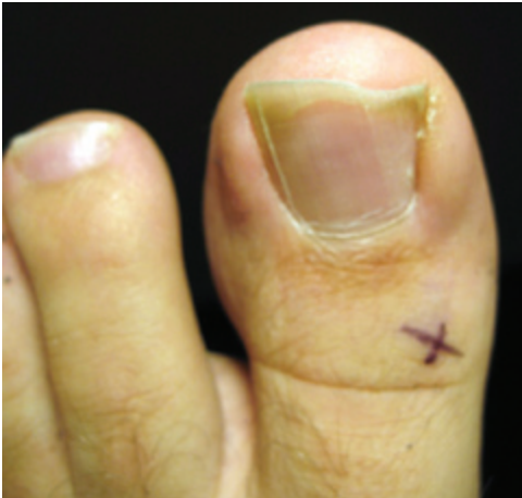
Figure 4. Ingrown left great toenail (medial right edge of the nail).