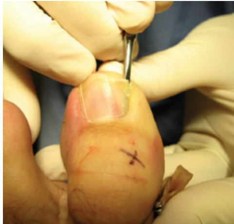
Figure 6. Separation of the nail from the nail bed with a nail elevator.