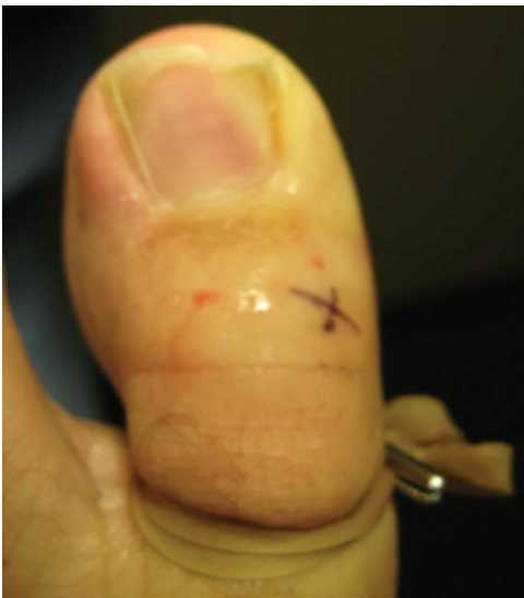
Figure 5. Application of tourniquet.