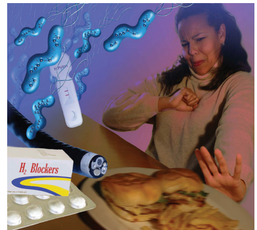
ILLUSTRATION BY EINDHATTON

Recent guidelines distinguish dyspepsia from heartburn and gastroesophageal reflux symptoms, which often coincide with dyspepsia but are considered separate entities. 5 Previous studies have used a variety of definitions for dyspepsia. As a result, further research is needed to better differentiate functional dyspepsia from other diseases of the gastrointestinal (GI) tract. To facilitate this research, the Rome III diagnostic