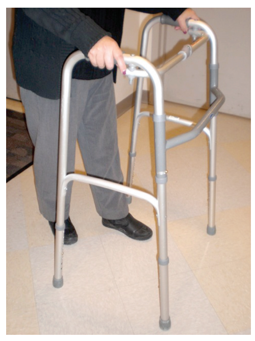
Figure 6. Standard walker. These walkers require lifting when propelling forward.