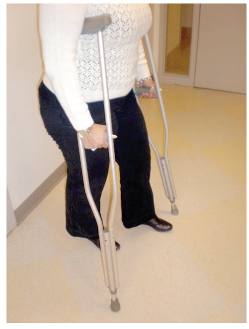
Figure 4. Axillary crutches. The height of the crutches leaves ample space between the crutch and axilla.

hand grips, allowing bilateral upper extremity support with occasional weight bearing. This allows the patient's hands to be free without needing to drop the crutch, making it less awkward to use, particularly on stairs.<sup>4</sup>