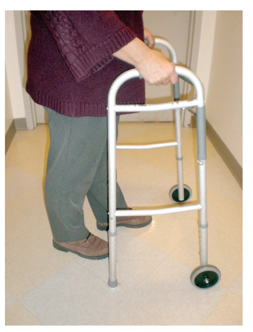
Figure 7. Front-wheeled walker.

The correct height of a cane or walker is at the level of the patient's wrist crease, which is measured with the patient standing upright with arms relaxed at his or her sides. When holding the device at this height, the patient's elbow is naturally flexed at a