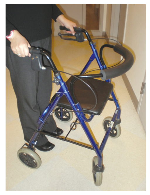
Figure 8. Four-wheeled walker. Although these walkers are easier to use than other types of walkers, they can roll forward unexpectedly and may increase fall risk.

15- to 30-degree angle.<sup>13</sup> The correct height for axillary crutches should be the distance from 1.6 to 2 inches (4 to 5 cm) below the axilla to the floor, 2 inches lateral and 5.9 inches (15 cm) anterior to the foot. The handle position should be where the elbow is in 30 degrees of flexion.<sup>4</sup> Forearm crutches are also used with the elbow flexed 15 to 30 degrees, and the forearm cuff should be