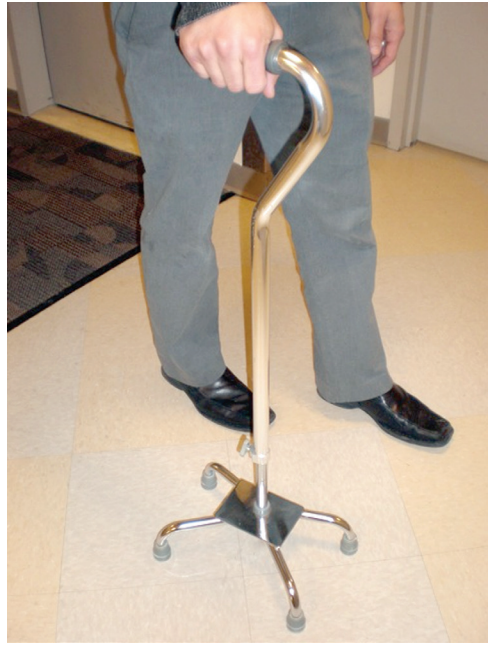
Figure 3. Quadripod cane. These canes have four legs for increased stability.