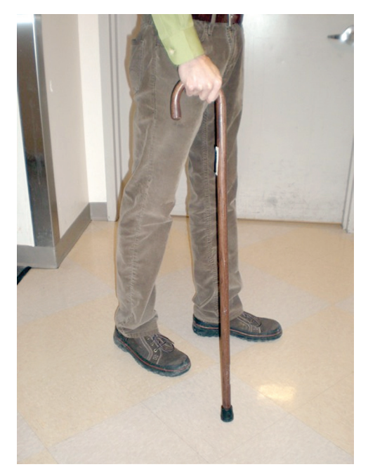
Figure 1. Standard cane.

extremity. It also can stand freely on its own if the patient needs to use his or her hands, and it can be particularly useful for patients with hemiplegia.<sup>11</sup> However, all four points of the cane must be in contact with the ground at the same time for proper use.<sup>10</sup>