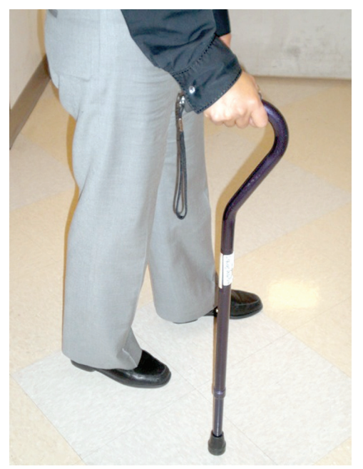
Figure 2. Offset cane. The curved handle helps distribute weight over the cane.

Crutches are helpful for patients who need to use their arms for weight bearing and propulsion and not just for balance.<sup>1</sup> One crutch can provide 80 percent weightbearing support, and two crutches provide 100 percent weight-bearing support.<sup>4</sup> However, crutches require substantial energy expenditure and arm and shoulder strength, making them generally inappropriate for frail older adults.<sup>4</sup>