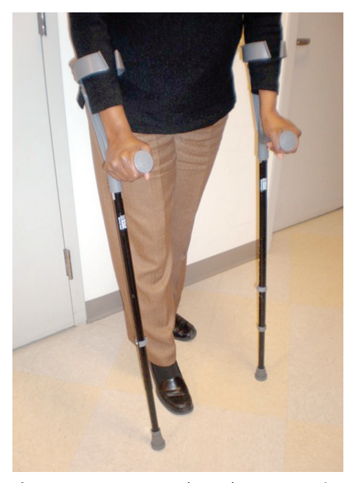
Figure 5. Forearm crutches. These are easier to use on stairs than other types of crutches.

A standard walker ( Figure 6 ) is the most stable walker, but it results in a slower gait because the patient must completely lift the walker off the ground with each step.<sup>4</sup> This may be useful for patients with cerebellar ataxia, but