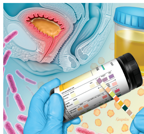
ILLUSTRATION BY JOHN W. KARAFEDOU

Urinary tract infections are the most common bacterial infections in women. Most urinary tract infections are acute uncomplicated cystitis. Identifiers of acute uncomplicated cystitis are frequency and dysuria in an immunocompetent woman of childbearing age who has no comorbidities or urologic abnormalities. Physical examination is typically normal or positive for suprapubic tenderness. A urinalysis, but not urine culture, is recommended in making the diagnosis. Guidelines recommend three options for first-line treatment of acute uncomplicated cystitis: fosfomycin, nitrofurantoin, and trimethoprim/sulfamethoxazole (in regions where the prevalence of Escherichia coli resistance does not exceed 20 percent). Beta-lactam antibiotics, amoxicillin/clavulanate, cefaclor, cefdinir, and cefpodoxime are not recommended for initial treatment because of concerns about resistance. Urine cultures are recommended in women with suspected pyelonephritis, women with symptoms that do not resolve or that recur within two to four weeks after completing treatment, and women who present with atypical symptoms. ( Am Fam Physician . 2011;84(7):771-776. Copyright © 2011 American Academy of Family Physicians.)