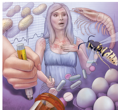
ILLUSTRATION BY SCOTT BOBEL

Anaphylaxis is a severe, life-threatening, systemic allergic reaction that is almost always unanticipated and may lead to death by airway obstruction or vascular collapse. Anaphylaxis occurs as the result of an allergen response, usually immunoglobulin E–mediated, which leads to mast cell and basophil activation and a combination of dermatologic, respiratory, cardiovascular, gastrointestinal, and neurologic symptoms. Dermatologic and respiratory symptoms are most common, occurring in 90 and 70 percent of episodes, respectively. The three most common triggers are food, insect stings, and medications. The diagnosis of anaphylaxis is typically made when symptoms occur within one hour of exposure to a specific antigen. Confirmatory testing using serum histamine and tryptase levels is difficult, because blood samples must be drawn with strict time considerations. Allergen skin testing and in vitro assay for serum immunoglobulin E of specific allergens do not reliably predict who will develop anaphylaxis. Administration of intramuscular epinephrine at the onset of anaphylaxis, before respiratory failure or cardiovascular compromise, is essential. Histamine H 1 receptor antagonists and corticosteroids may be useful adjuncts. All patients at risk of recurrent anaphylaxis should be educated about the appropriate use of prescription epinephrine autoinjectors. ( Am Fam Physician . 2011;84(10):1111-1118. Copyright © 2011 American Academy of Family Physicians.)