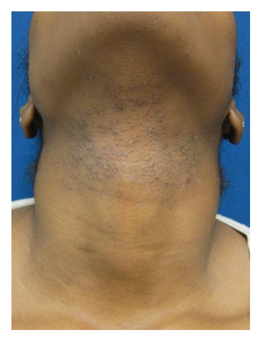
Figure 2. Pseudofolliculitis barbae. Hyperpigmented and skin-colored papules and macules in a beard distribution on a black patient.