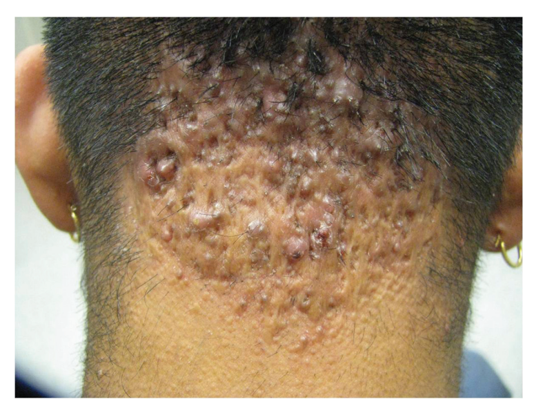
Figure 3. Acne keloidalis nuchae. Firm, pink papules coalescing into a keloidal plaque in a young Hispanic patient. Significant hair loss is noted in the affected area.

(class I and II), intralesional steroids, topical and oral antibiotics, topical and oral retinoids, imiquimod (Aldara), laser therapy, and surgical excision. 14,19,20 Initial therapy begins with topical steroids, topical antibiotics, or both. Because treatment can be challenging, a combination of these therapies is usually indicated. Topical steroids in combination with topical antibiotics or retinoids can be effective in flattening lesions and decreasing symptoms. For draining or purulent lesions, bacterial culture permitting appropriate oral antibiotic selection is helpful.