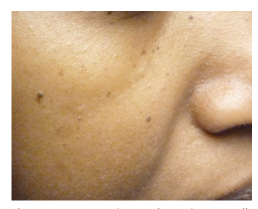
Figure 1. Dermatosis papulosa nigra. Small, smooth brown papules in the malar area of a black woman.

Medical management includes use of a mild- to medium-potency topical steroid immediately after shaving, benzoyl peroxide or a topical antibiotic in the morning,