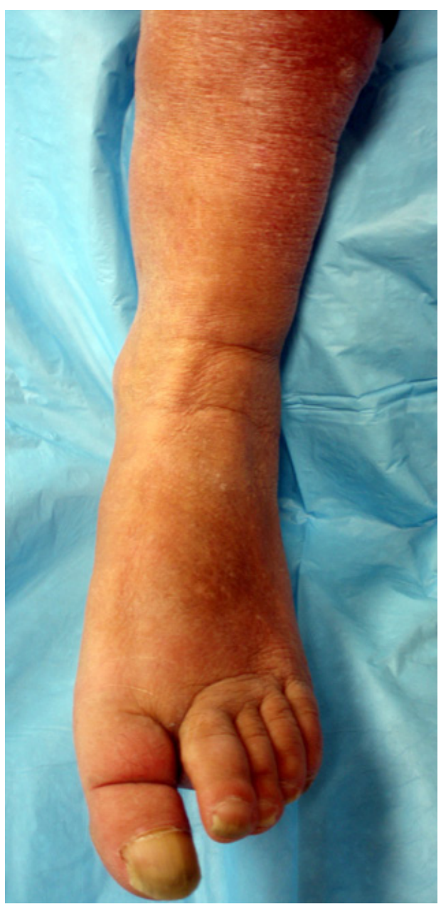
eFigure B. Pretibial myxedema causing a peau d'orange appearance in a patient with Graves disease.