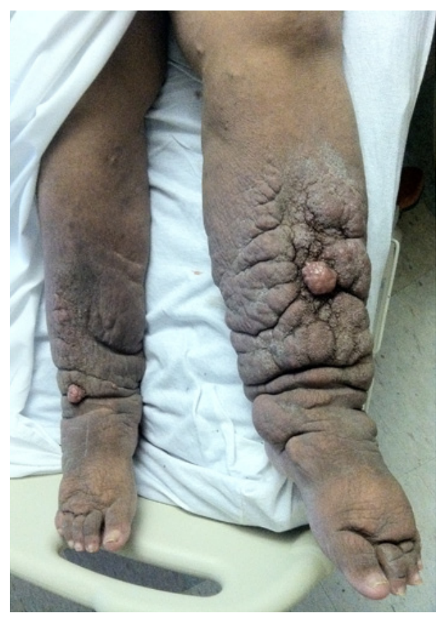
eFigure C. Long-standing lymphedema with thickened, verrucous skin.