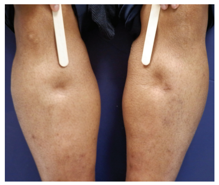
Figure 3. Pitting edema, bilateral, as observed in a patient with congestive heart failure.

channels, is the method of choice for evaluating lymphedema when the diagnosis cannot be made clinically.<sup>11,21</sup>