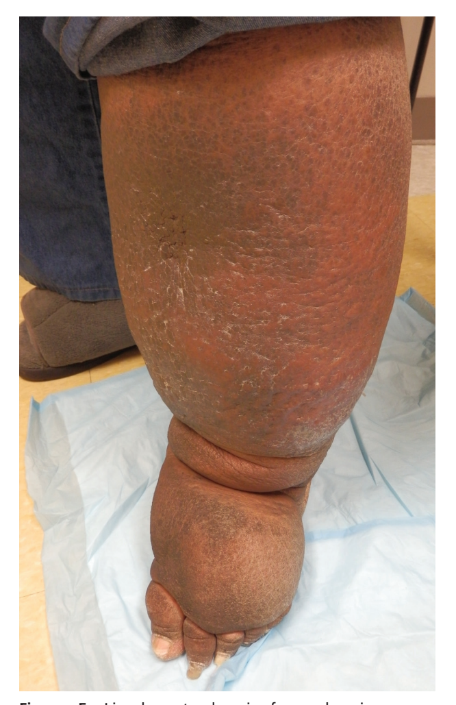
Figure 5. Lipodermatosclerosis from chronic venous insufficiency associated with marked sclerotic and hyperpigmented tissue.

Mixed evidence exists for the use of pneumatic compression devices in patients with chronic venous insufficiency.<sup>29,32</sup> However, these devices should be considered for patients in whom compression stockings are contraindicated. For mild to moderate chronic venous insufficiency, oral horse chestnut seed extract may be an alternative or adjunctive treatment to compression therapy.<sup>33,34</sup>