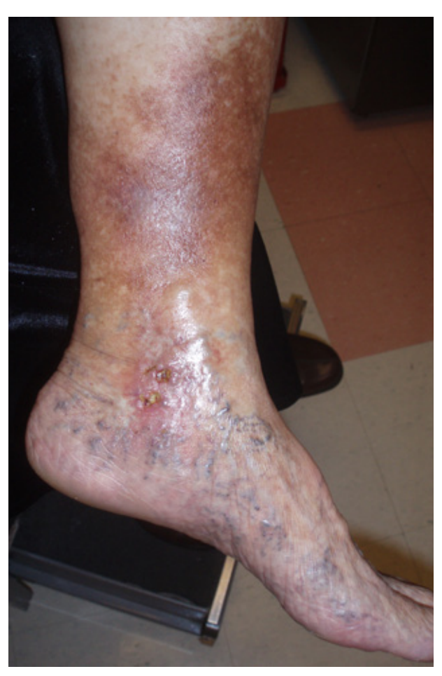
eFigure A. Venous insufficiency with venous stasis ulcer over the medial malleolus. Note the yellow-brown hemosiderin deposition.