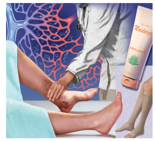
ILLUSTRATION BY CRAIG ZUCKERMAN

dermatitis can be managed with emollients and topical steroid creams. Patients who have had deep venous thrombosis should wear compression stockings to prevent postthrombotic syndrome. If clinical suspicion for deep venous thrombosis remains high after negative results are noted on duplex ultrasonography, further investigation may include magnetic resonance venography to rule out pelvic or thigh proximal venous thrombosis or compression. Obstructive sleep apnea may cause bilateral leg edema even in the absence of pulmonary hypertension. Brawny, nonpitting skin with edema characterizes lymphedema, which can present in one or both lower extremities. Possible secondary causes of lymphedema include tumor, trauma, previous pelvic surgery, inguinal lymphadenectomy, and previous radiation therapy. Use of pneumatic compression devices or compression stockings may be helpful in these cases. ( Am Fam Physician . 2013;88(2):102-110. Copyright © 2013 American Academy of Family Physicians.)