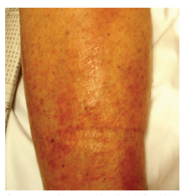
Figure 4. Acute deep venous thrombosis with overlying cellulitis.

elevation and compression stockings with 20 to 30 mm Hg for mild edema and 30 to 40 mm Hg for severe edema complicated by ulceration, are recommended.<sup>1,4,5,8,29</sup> Compression therapy is contraindicated in patients with peripheral arterial disease. A study of 120 patients with