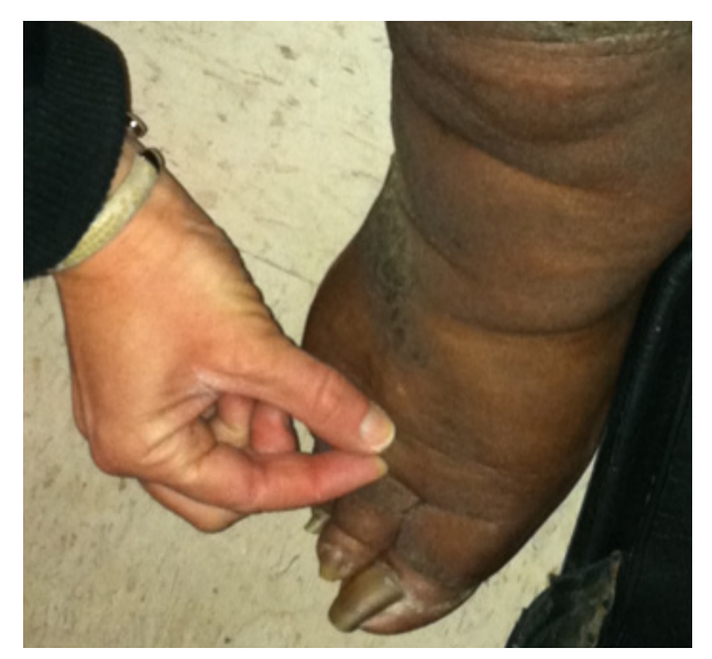
eFigure D. Failure to tent the skin overlying the dorsum of the second toe using a pincer grasp (Kaposi-Stemmer sign) in a patient with lymphedema.