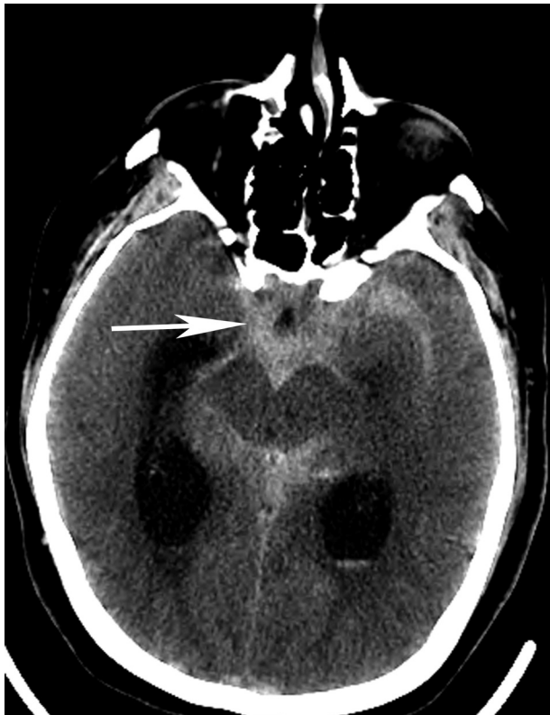
Figure 2. Noncontrast computed tomography of the head showing subarachnoid hemorrhage (arrow).

been excluded. 29 Despite these findings, lumbar puncture remains the standard of care for ruling out SAH when noncontrast head CT is negative. 1 Head CTA has a specificity of 100% with a sensitivity of 96% to 99.7% for aneurysms 4 mm or larger. 25 After SAH is detected on noncontrast head CT or lumbar puncture, imaging of the cerebral vasculature should be performed. With the above sensitivities, widespread availability, and rapid acquisition time, CTA of the head should be performed and the patient should be referred to a neurosurgeon. 1,3,4