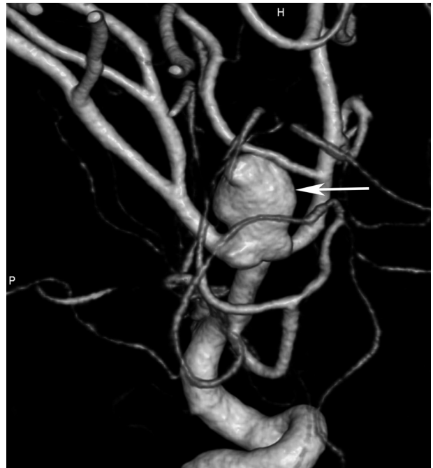
Figure 3. Middle cerebral artery aneurysm (arrow) demonstrated on a reconstructed three-dimensional angiogram via computed tomographic angiography.

Magnetic resonance angiography is an alternative for studying the cerebral vasculature. Although the