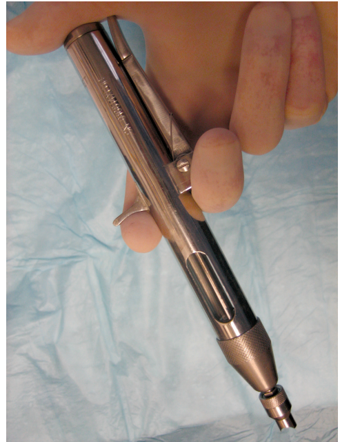
Figure 2. High-pressure jet injector for delivering anesthetic spray during no-needle vasectomy procedure.

A systematic review of six RCTs demonstrated no difference in failure rate between the ligation and excision technique compared with vas occlusion with surgical clips (without transection of the vas). 6 The same study evaluated the effects of fascial interposition (Figure 3 7 ), a method of burying