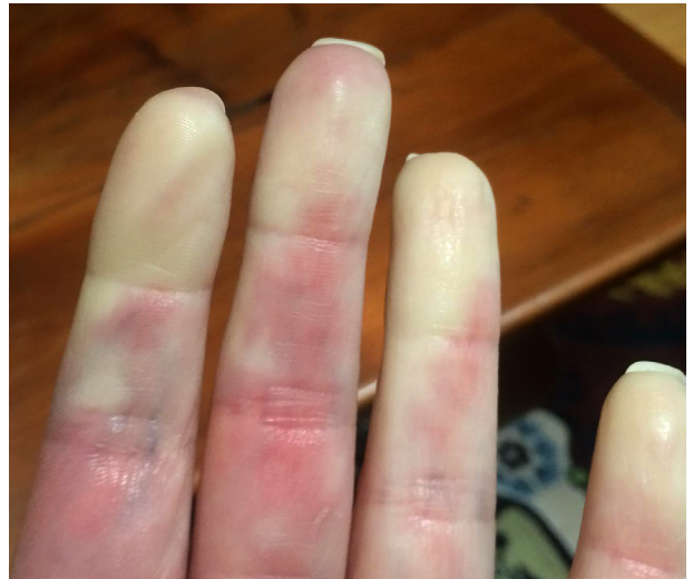
Figure 4. Raynaud phenomenon.

should be done at three- to six-month intervals. 8,33 When a patient with SLE has clinical or laboratory features that suggest nephritis, 24-hour urine testing for protein or a spot urine protein:creatinine ratio should be obtained. 27 Referral for renal biopsy should be considered in patients with proteinuria of at least 1 g in 24 hours, or at least 0.5 g in 24 hours with hematuria or cellular casts. A combination of glucocorticoid plus