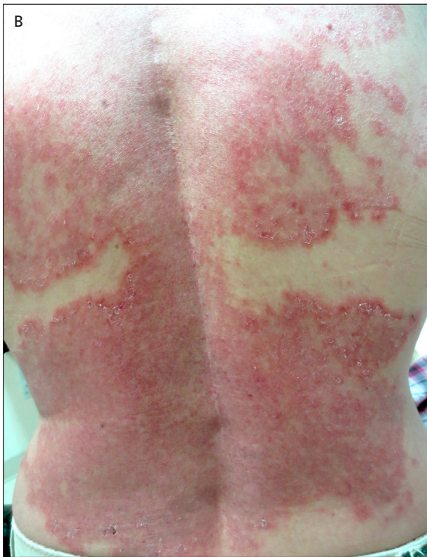
Figure 3. Subacute cutaneous lupus rash on the (A) neck and (B) back.

should be done at three- to six-month intervals. 8,33 When a patient with SLE has clinical or laboratory features that suggest nephritis, 24-hour urine testing for protein or a spot urine protein:creatinine ratio should be obtained. 27 Referral for renal biopsy should be considered in patients with proteinuria of at least 1 g in 24 hours, or at least 0.5 g in 24 hours with hematuria or cellular casts. A combination of glucocorticoid plus