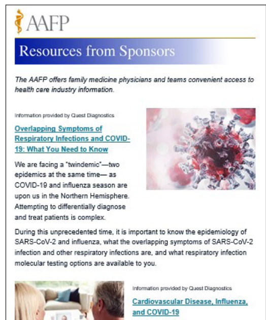
Sponsored Resource Center eNewsletter from aafp.org