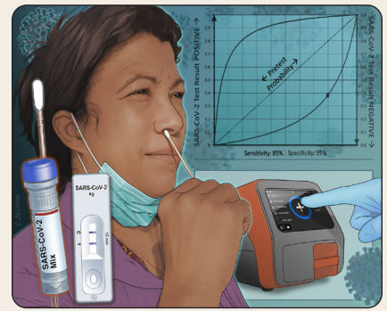
Illustration by Catherine Delphia