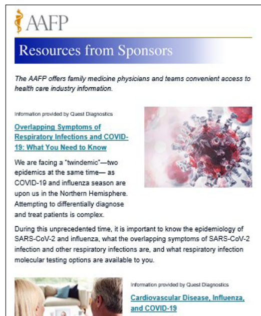
Sponsored Resource Center eNewsletter from aafp.org