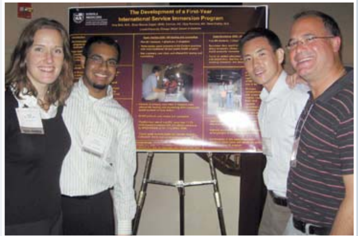
Sixteen posters were presented at the workshop's two Networking Receptions.

In 2000, the AAFP Center for International Health Initiatives (CIHI) was created to increase interest in global development of family medicine, lead the process of the workshop CME framework development, and serve as the workshop faculty. The CIHI advisory board develops the programming for this event.