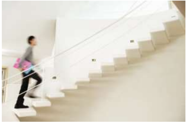
Danilkewich A, et al. Implementing an evidence-informed faculty development program. Can Fam Physician . 2012 Jun; 58(6):e337-43