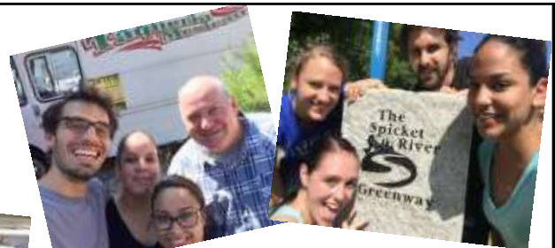
PCMH Team Building