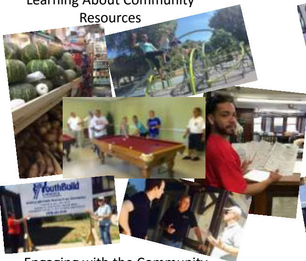
Engaging with the Community