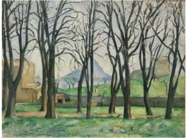
Cezanne Chestnut Trees