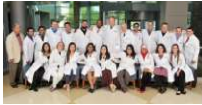
AMITA HEALTH ADVENTIST MEDICAL CENTER LA GRANGE