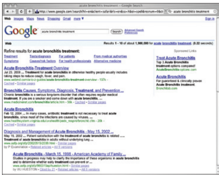
Figure 3. Sample Google search.