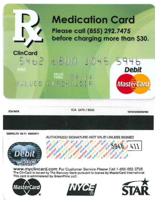
Figure 2 Rx card.

home and cell phone numbers as well as an email address which were provided on a volunteer basis by enrolled patients to allow automatic reminders for next visits, if desired by the patient. Cards have unique numbers that are assigned to individual patients. This card number then becomes the basis for patient tracking across the ClinCard system.