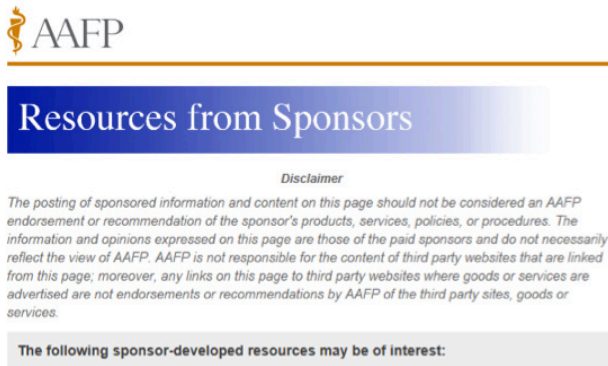
Image: 60x80 Headline Lorem ipsum dolor sit amet, consectetur adipiscing elit, sed diam nonummy nibh euismod tincidunt ut laoreet dolore magna aliquam erat volutpat. Ut wisi enim ad minim veniam, quis nostrud exercitation ullam corper suscipit lobortis nisl ut aliquip ex ea commodo consequat.