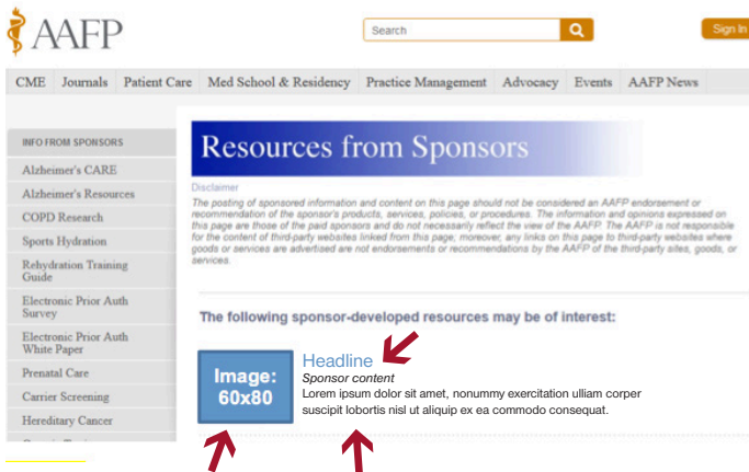
Image: 60x80 Headline Sponsor content Lorem ipsum dolor sit amet, nonummy exercitation ullam corper suscipit lobortis nisl ut aliquip ex ea commodo consequat.