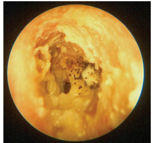
Figure 4. Otomycosis caused by Aspergillus . Note the characteristic gray-black fungal elements on the debris.

verification that the tympanic membrane is intact. Tenderness with movement of the tragus or pinna is a classic finding.