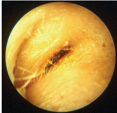
Figure 2. Acute otitis externa on otoscopic examination. Note marked canal edema.