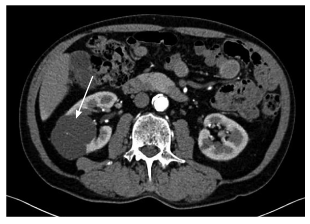
Figure 3. Nonenhancing 5-cm right renal cyst with thin septa (arrow). Bosniak category IIF.

According to the 2007 consensus guidelines of the American College of Obstetricians and Gynecologists, most ovarian incidentalomas are benign and are often functional cysts in premenopausal women and cystadenomas