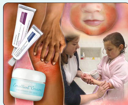
Illustration by Jennifer Fairman

Atopic dermatitis , or atopic eczema, is a chronic relapsing and remitting inflammatory skin disease with a 10% lifetime prevalence. 1 The disease is characterized primarily by scaly, pruritic, erythematous lesions located on flexural surfaces. Atopic dermatitis affects up to 12% of children and 7.2% of adults, leading to high health care use. 2 Atopic dermatitis typically starts in childhood, with 60% of patients developing atopic dermatitis before one year of