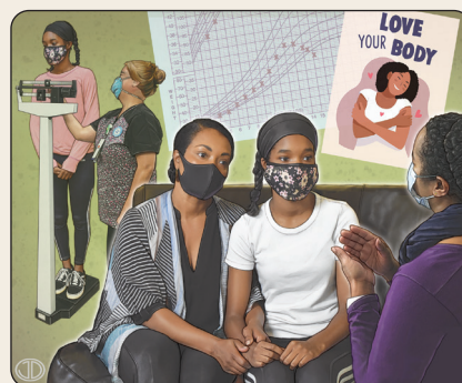
Illustration by Jonathan Dimes

Eating disorders are potentially life-threatening conditions characterized by disordered eating and weight-control behaviors that impair physical health and psychosocial functioning. 1-3 Adolescence and early adulthood are vulnerable periods for the development of eating disorders; however, up to 8% of females and 2% of males are affected